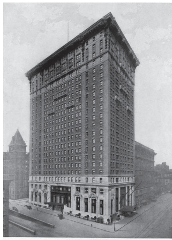
THE HOTEL BELMONT

During the early years of the club, they held monthly meetings in a room in the Waldorf Astoria Hotel. These get-togethers served to build personal friend-